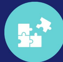
Soft skills training