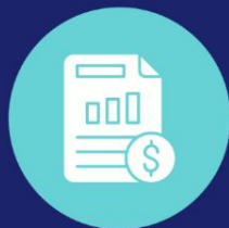
Sales strategy and Execution