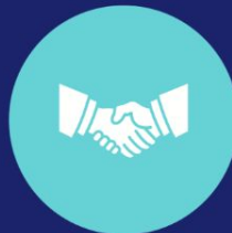
Investor and Export Readiness Check