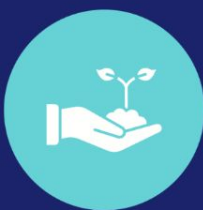
Environmental impact assessment