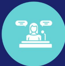
Investor outreach and pitch preparation