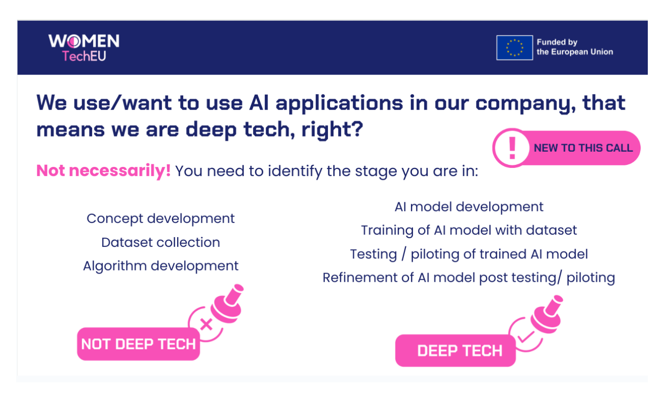
Figure 2: Development stages of AI algorithms